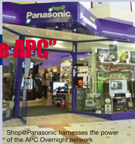
Shop@Panasonic harnesses the power of the APC Overnight network

"After trying every major courier service and having been let down time after time